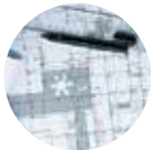
Pre-Construction Budget & Specification Consulting