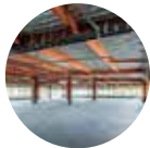
Concrete & Surface Prep