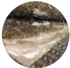
Moisture Control Systems