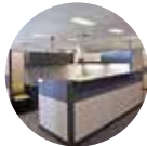
Furniture Lift Installation