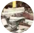
Reclamation & Recycling